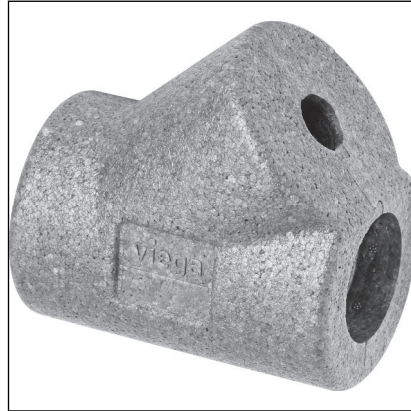
Fig. 5: Model 2210.12 Easytop insulating shell