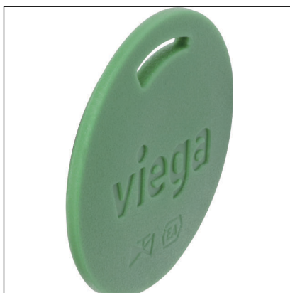
Fig. 4: Model 2237.26 Easytop media marking