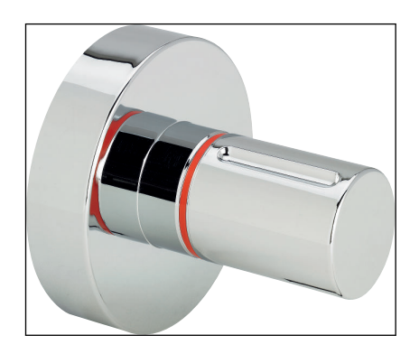
Fig. 1: Model 2236.10, equipment set