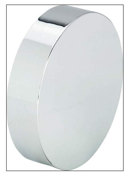
Fig. 3: Model 2236.50, public building model