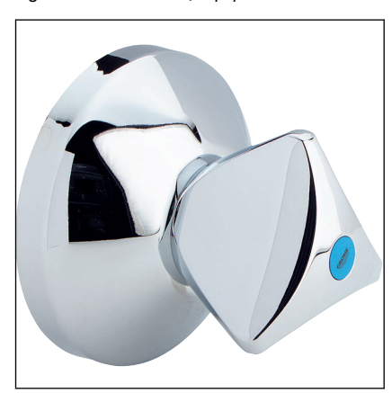
Fig. 2: Model 2236, equipment set