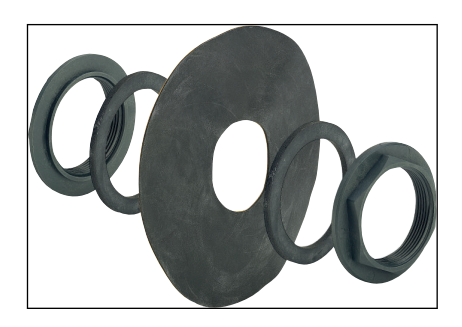
Fig. 4: Model 2235.90, mounting set front position