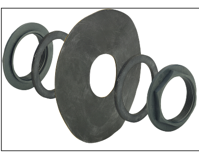
Fig. 5: 2235.90 Fixing set front