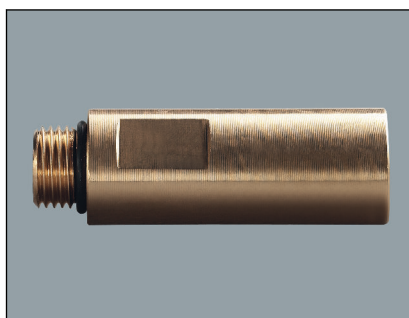
Fig. 3: Model 2234.5 Easytop extension