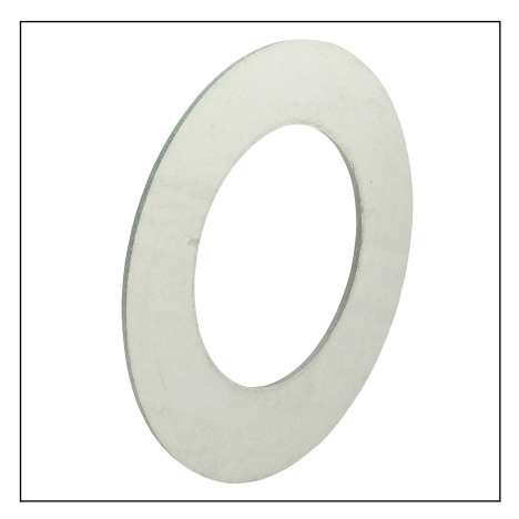
Fig. 4: Model 2259.9 / XL seal