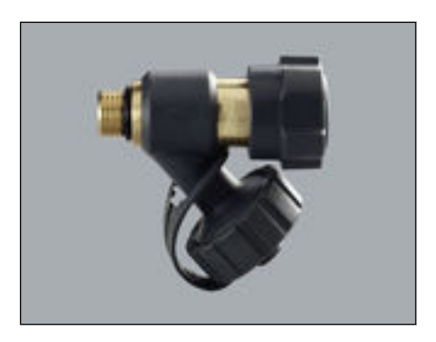
Fig. 2: Model 2234 Easytop drainage valve with threaded connection G %