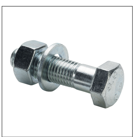
Fig. 3: Model 2259.7 / XL mounting set