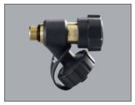
Fig. 2: Model 2234 Easytop drainage valve with threaded connection G \rlap{k}_4