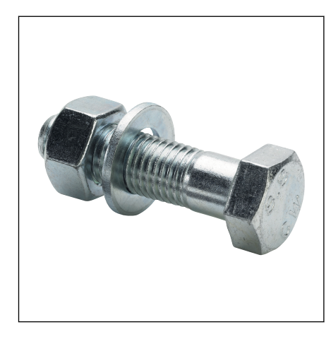
Fig. 3: Model 2259.7 / XL mounting set