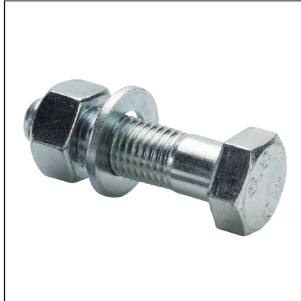
Fig. 3: Model 2259.7 / XL mounting set