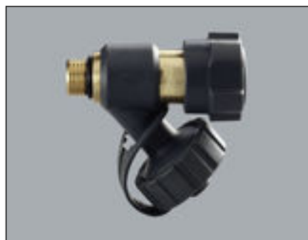
Fig. 2: Model 2234 Easytop drainage valve with threaded connection G ¼