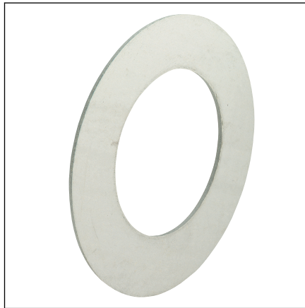
Fig. 4: Model 2259.9 / XL seal