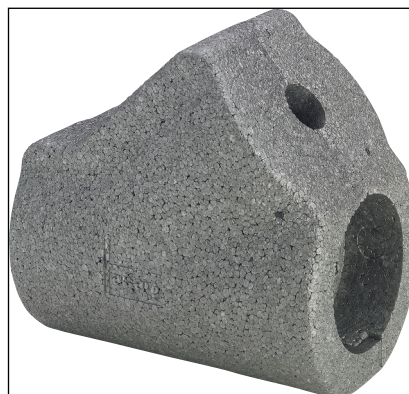
Fig. 4: Model 2210.10 Easytop insulating shell

EPS insulating shells are available for all sizes of valves. The two-piece shells are self-securing and mounted with tools and holding clamps: they connect seamlessly onto the flat surface of the pipe insulation. When installing a drainage valve or an extension with drainage valve, a predetermined breaking point is broken out of the insulating shell.