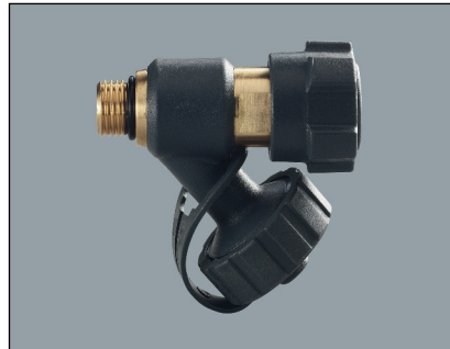
Fig. 2: Model 2234 Easytop drainage valve