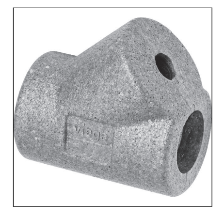
Fig. 4: Model 2210.12 Easytop insulating shell

EPS insulating shells are available for all sizes of valves. The two-piece shells are self-securing and mounted with tools and holding clamps: they connect seamlessly onto the flat surface of the pipe insulation. When installing a drainage valve or an extension with drainage valve, a predetermined breaking point is broken out of the insulating shell.