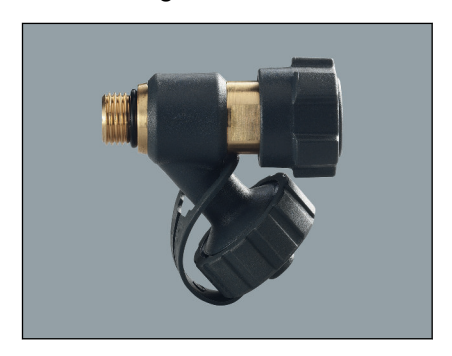
Fig. 2: Model 2234 Easytop drainage valve