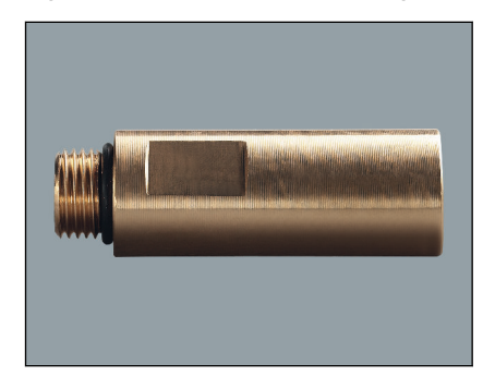
Fig. 3: Model 2234.5 Easytop extension