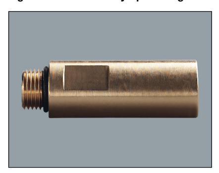
Fig. 3: Model 2234.5 Easytop extension