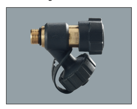
Fig. 2: Model 2234 Easytop drainage valve