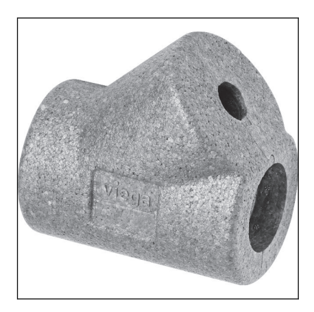
Fig. 5: Model 2210.12 Easytop insulating shell