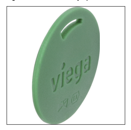
Fig. 4: Model 2237.26 Easytop media marking