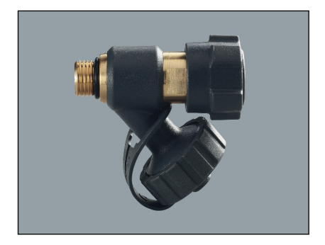
Fig. 2: Model 2234 Easytop drainage valve