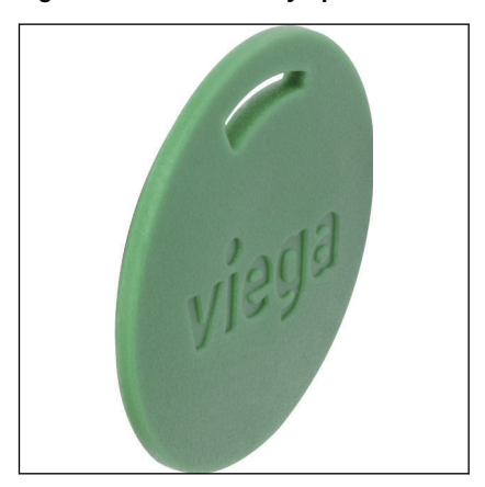
Fig. 4: Model 2237.25 Easytop media marking