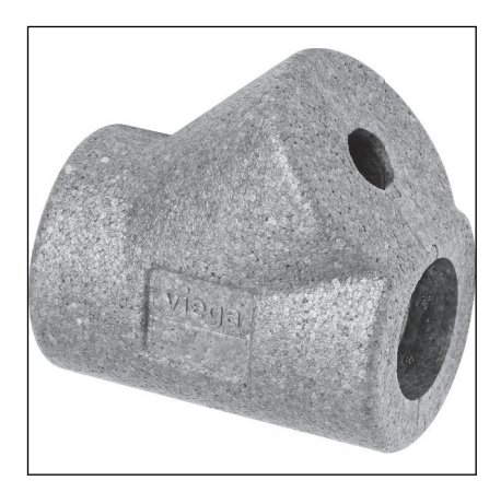
Fig. 5: Model 2210.12 Easytop insulating shell

EPS insulating shells are available for all sizes of valves. The two-piece shells are self-securing and mounted with tools and holding clamps: they connect seamlessly onto the flat surface of the pipe insulation. When installing a drainage valve or an extension with drainage valve, a predetermined breaking point is broken out of the insulating shell.