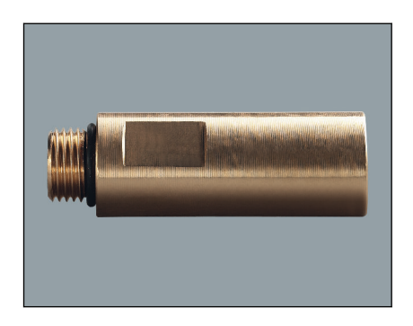
Fig. 3: Model 2234.5 Easytop extension