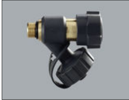
Fig. 2: Model 2234 Easytop drainage valve with threaded connection G ¼