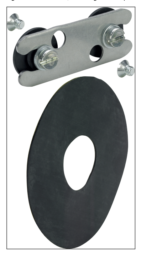
Fig. 5: Model 2235.95, mounting set rear position