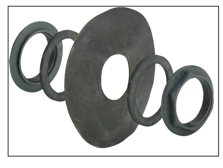
Fig. 7: 2235.90 Fixing set front