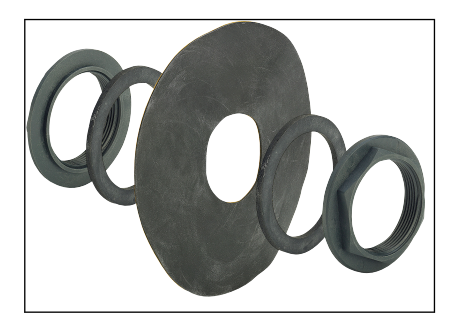
Fig. 5: 2235.90 Fixing set front