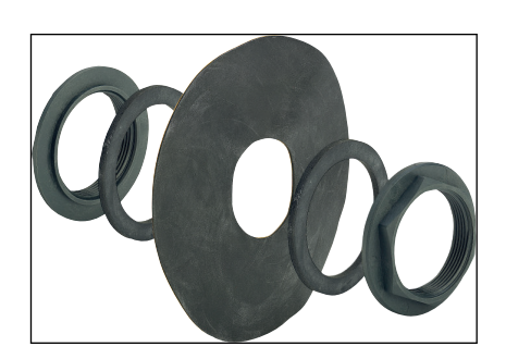
Fig. 4: Model 2235.90, mounting set front position