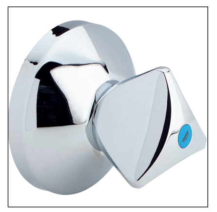
Fig. 2: Model 2236, equipment set